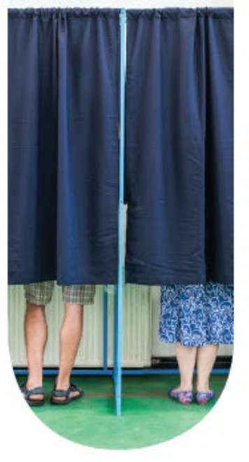
Citizen Engagement and Participation