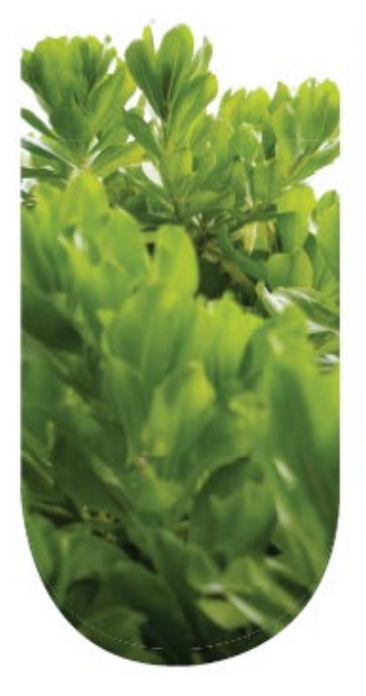
Strengthened Climate Resilience

Sustainable Agriculture, Fisheries, and Food Systems