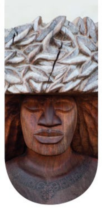
Access to Arts Education for Youth

Nurturing and Cultivating Hawai'i's Diverse Cultures